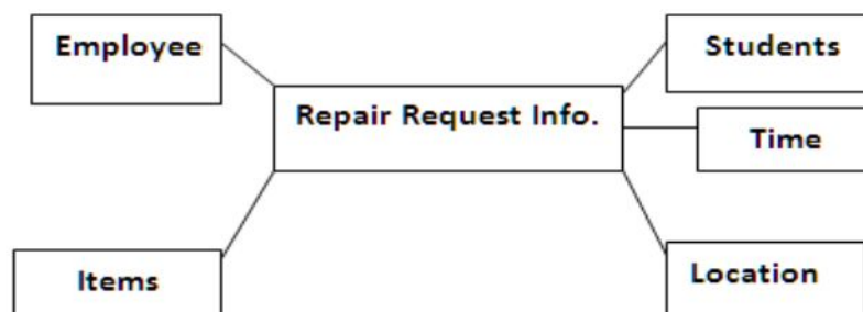
Fig: Developed Star Schema for the proposed Data warehouse