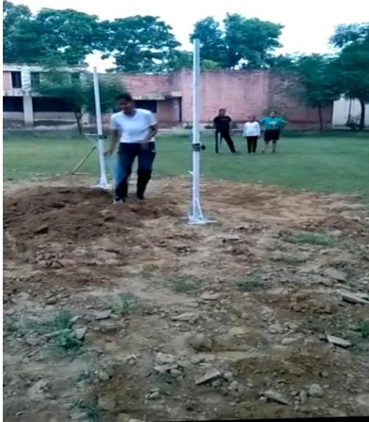
Long Jump Training