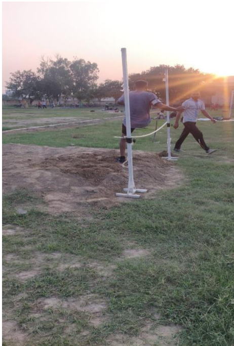
High Jump Training