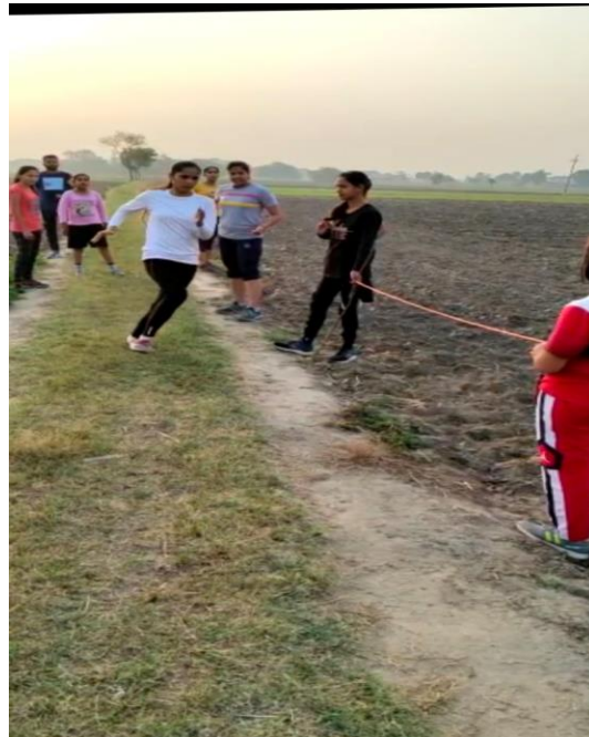
High Jump Training