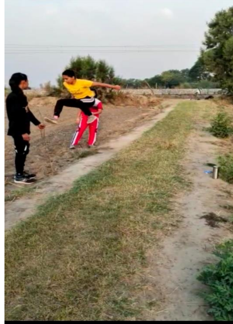
Long Jump Training